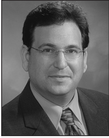
By: Steven D. Spitz, DMD Prosthodontist/Dental Implant Specialist

bone immediately begins to resorb and the surrounding teeth begin to move. For example, visualize a bookcase, securely end-to-end with books. As a single book is removed, from any location, over time gravity will cause the remaining books to lean toward the space. The placement of an implant will prevent that movement as well as continue to stimulate the bone, especially if a tooth has been missing for a period of time.